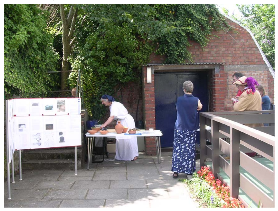
National Archaeology Day 2005 Roman Cookery Exhibition and Demonstration

assortment of craft demonstrations such as leather shoe making and weaving and also a display of reproduction military equipment with warriors dressed for battle. A medieval archer of the 'Bowmen of the Rose' demonstrated the skills of the archer and the power of the Welsh longbow. The opportunity was provided for members of the public to try on replica armour and learn about everyday objects of the time. The event was extremely well attended, as the venue is more readily accessible than the Trust's Offices, and attracted passers-by who had not noted any of the advance publicity. The museum reported a substantial increase in visitor numbers over a normal Saturday.