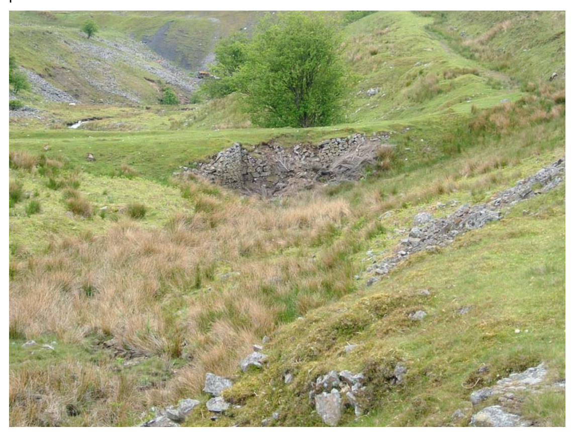
Part of the Trevil Limestone Railway lying in the Heads of The Valleys Regeneration Area. Routes such as this historically linked communities (in this case Trefil and Ebbw Vale) and their related industrial bases. With sensitive improvement and management they would present ideal pathways for communities to access both the past and the countryside.

information on current condition/value added. Data storage, manipulation, analysis, interrogation, presentation and future update of information has and will be undertaken through GIS system. The Information Technology component of the project has allowed a dynamic, multi-layered digital model for the study area to be produced.