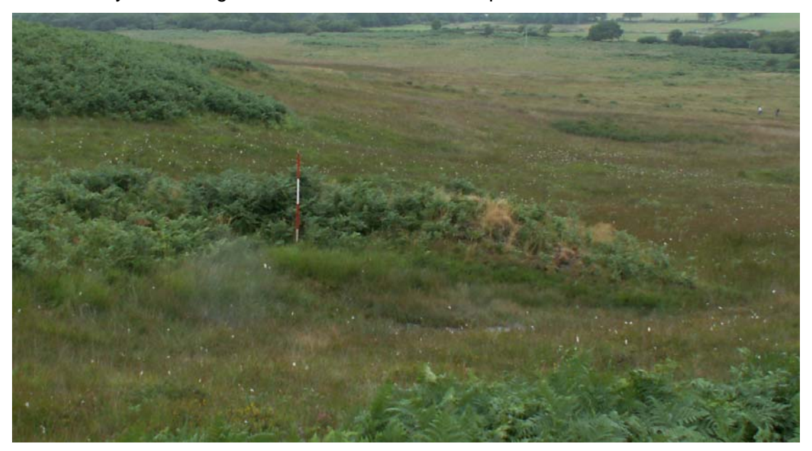
Crescent-shaped burnt mound with ranging rod placed in the centre of the inner edge of crescent. Note the very boggy ground indicated by the bog-cotton. Burnt Mounds are often found near streams (PRN 02144w, Cefn Bryn on the Gower).

To date, we have verified eleven of the eighteen mounds listed on the Sites and Monuments Record. Sketches of the monument and the immediate surroundings, and site photographs were obtained for each site, and panoramic photographs were taken where weather permitted. Earthwork surveys using triangulation from a baseline were done where time allowed giving us accurate information about the form of many of these monuments. These details were gathered to verify the information we had on these monuments, but also to obtain more detailed and helpful information on their form that had been previously lacking and to enable us to review more clearly something of their cultural and landscape context.