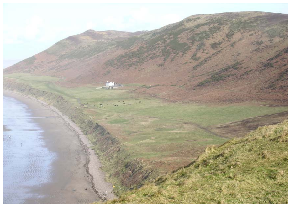
Gower Historic Landscape HLCAs 008 Rhossili Bay [I] 013 Lower Rhossili Enclosed Coastal Strip [c] and 023 Rhossili Down [r]

The work was carried out to the established methodology of the recent Historic Landscape Characterisation projects carried out in Wales. This project has involved a rapid trawl of the Sites and Monuments Record and other readily available sources, in order to identify distinctive historic landscape character areas where significant historical/archaeological qualities, interests or themes are discernible. In order to understand and appraise the general landscape character and relative quality a day visit was made to a selection of key areas. As a result of this rapid survey eighty-seven character areas were identified and described for Gower.