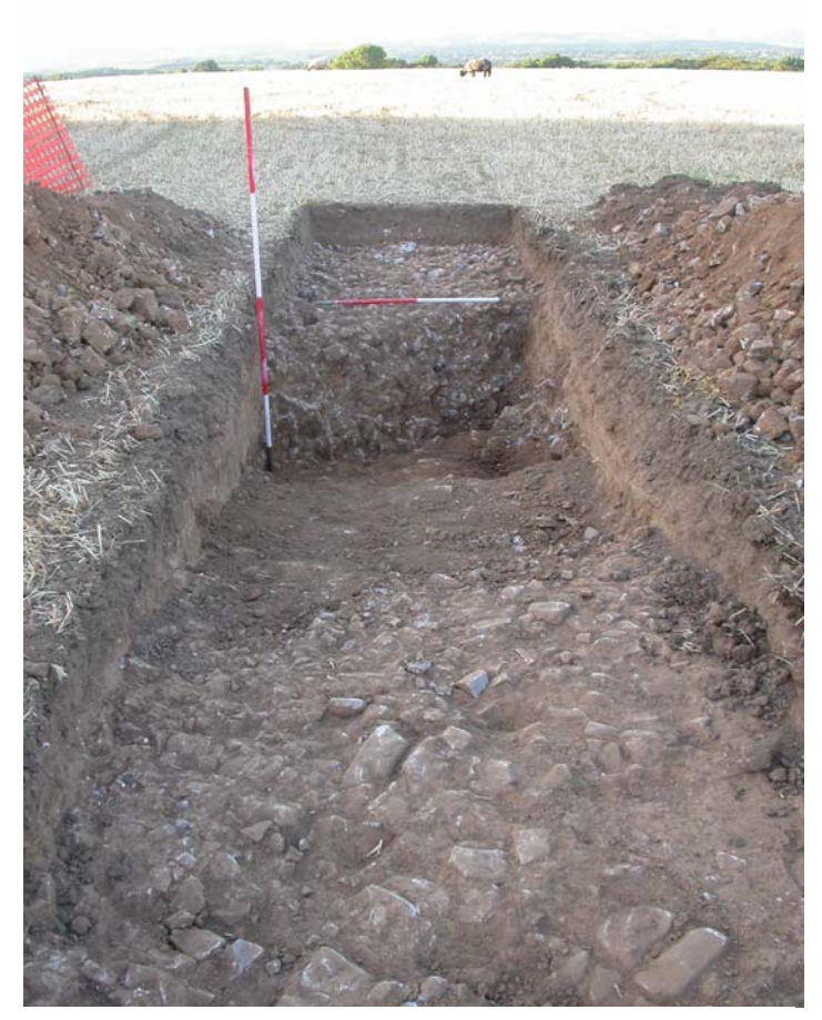
Norton Enclosure, partially excavated ditch section

The Graig Fawr chambered tomb (SAM Gm 513) was discovered in 1989 and consists of two separate monolithic chambers with a possible robbed mound. It was envisaged that a close-set contour survey on the monument would provide an accurate record of the chambers and possibly locate the position of the original mound, which would in turn permit the scheduled area to be extended. The results obtained from the survey showed two chambers (A and B) c3m apart, formed from relatively small and thin slabs of the local Pennant sandstone, each chamber having multiple compartments. The mound has been largely destroyed; indeed, it is difficult to distinguish its remains from the natural unevenness of the ground. However, the results of the survey demonstrated the existence of a crescent mound to the west of