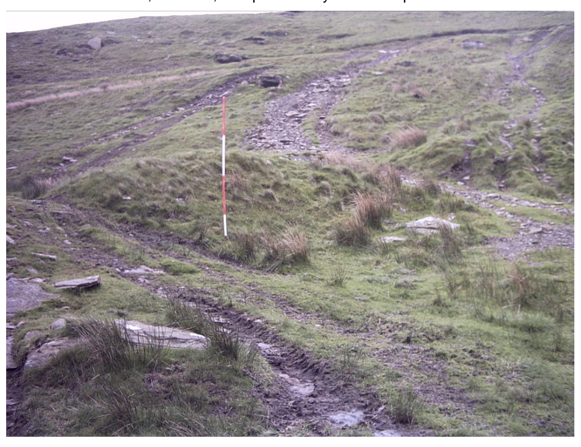
Bwlch y Clawdd Cross-ridge Dyke SAM GM 500, with section removed by access track and further wear caused by other vehicular crossing-points.

During the initial stages of the fieldwork permission was obtained to augur seven of the sixteen sites and one of these sites, Bedd Eiddil (PRN 02266.0m), was chosen for excavation. The remaining sites were subjected to a condition survey only, as the permission to augur and/or excavate could not be obtained from the landowners. Access to these sites, however, was provided by the new Open Access initiative.